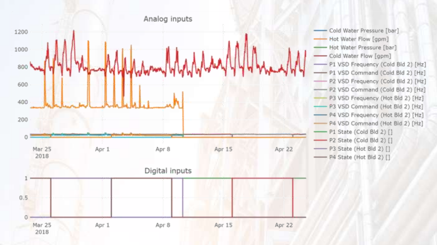
Figure 1 – Normal pattern of Cold/Hot water pumps

The advantage of continuous monitoring, protocols agnostics, enabled to save a "human-hours" by producing automatic and continuous operational reports according to the customer's demand, either by receiving real-time data on each process and / or critical end-points for monitoring as a separate and independent system which detects faults in real time.