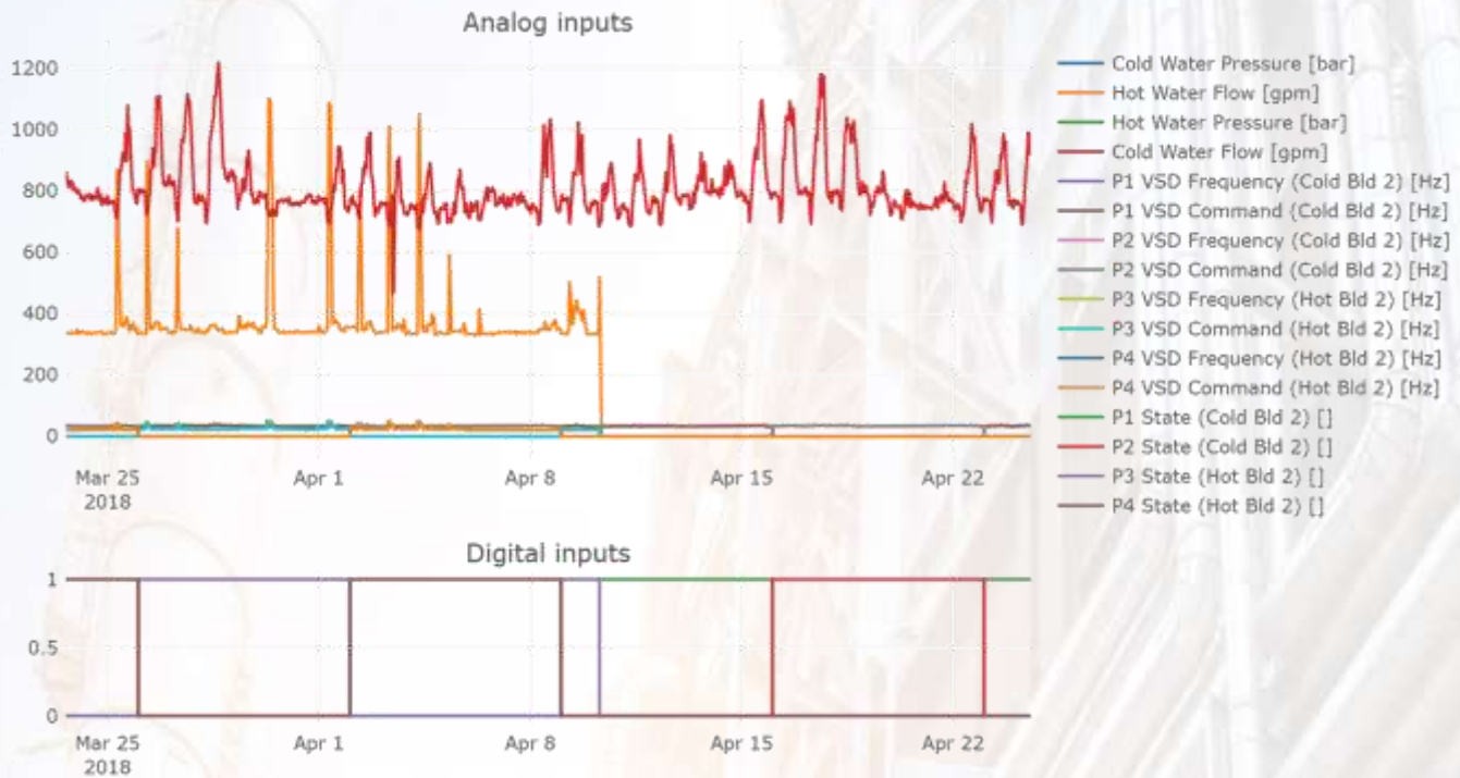
Figure 1 – Normal pattern of Cold/Hot water pumps

The advantage of continuous monitoring, protocols agnostics, enabled to save a “human-hours” by producing automatic and continuous operational reports according to the customer's demand, either by receiving real-time data on each process and / or critical end-points for monitoring as a separate and independent system which detects faults in real time.